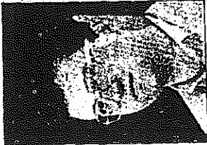
Dobroslav Paraga: 'Many of our people will have to die' before Croatia is liberated.

The Defense Forces sometimes fight in the name of the Croatian National Guard, Paraga said. But diplomats said they also pursue objectives contrary to government policy.