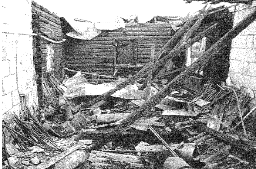
Religious intolerance towards Jehovah's Witnesses in Russia continues unabated