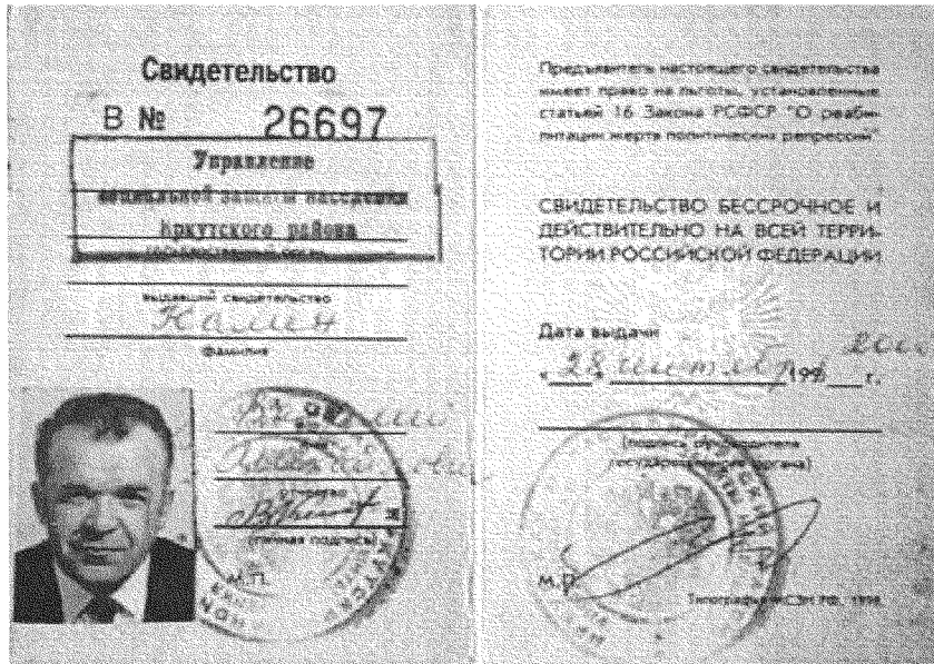
His certificate of rehabilitation as a victim of political repression.