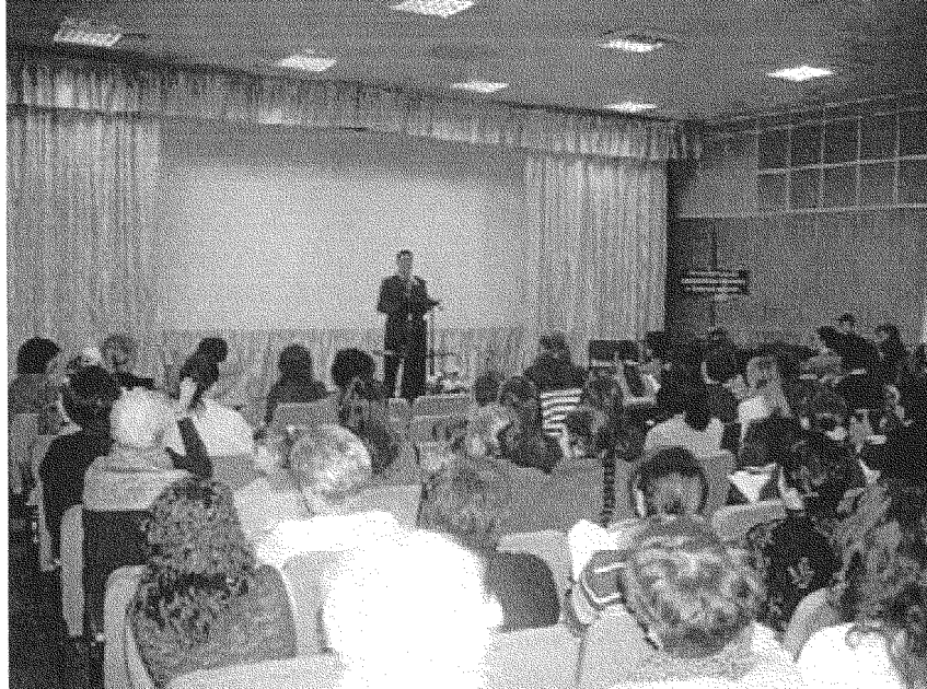
A congregation meeting of Jehovah's Witnesses in Naberezhniye Chelny was interrupted by police officers and the FSB.

The European Court of Human Rights has stressed that disruption of the religious meetings of Jehovah's Witnesses is a violation of the Convention, stating "The Court further reiterates that Article 9 of the Convention protects acts of worship and devotion which are aspects of the practice of a religion or belief in a generally recognised form . . . It is undeniable that the collective study and discussion of religious texts by the members of the religious group of Jehovah's Witnesses was a recognised form of manifestation of their religion in worship and teaching. Thus, the applicants' meeting on 16 April 2000 attracted the protection of Article 9 of the Convention." (Judgment in the case of Kuznetsov and Others v. Russia, 11 January 2007, paragraph 57).