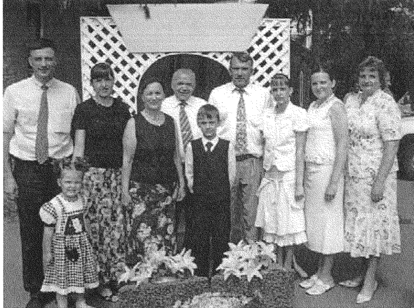
Today, with his children and grandchildren.