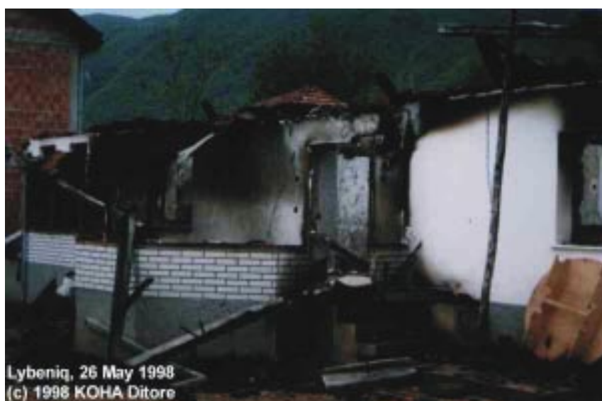
Lybeniq, 26 May 1998