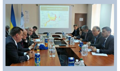
In Kyiv, members of the delegation met with (from top)Prime Minister Arseniy Yatsenyuk, President Petro Poroshenko, and officials from the OSCE Special Monitoring Mission in Ukraine.