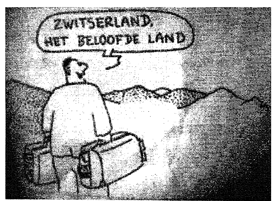
De Morgen, September 8, 2011