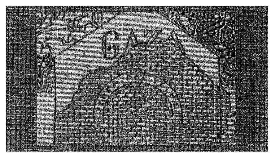
Dagbladet, October 19, 2011